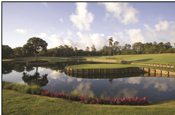
TPC Sawgrass – THE PLAYERS Stadium Course